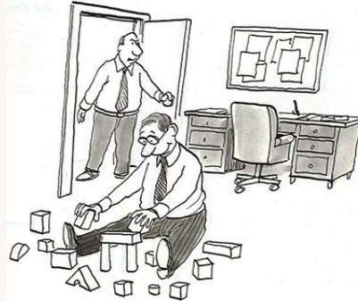
"But. It's keeping me sober!" —Lynne D., Carbondale, IL.